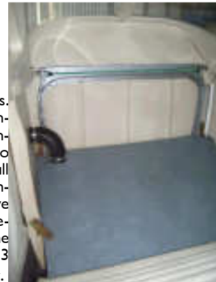
Auxiliary Tank built into the cargo bay behind rear seats

very good friends. As far as the Wynyard Club's concerned it's great to have everyone pull together, for example our hangars, we pooled our resources and built the hangars and have 13 aircraft in here now.