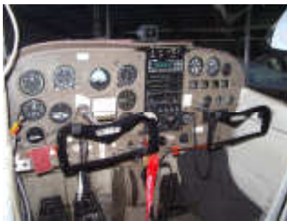
Lower L auxiliary fuel tank pump switch

Max has taken DMY right around the coastline of Australia on one of his trips, Darwin and the Gulf a couple of times, Western Australia, "I've got a fair few lines on maps! Max laughs. "It's what I set out to do, I wanted to see Australia, that all started in 1976 and it's ongoing, there's still a lot of Australia I want to see."