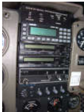
Tidy and comprehensive

"I did a trip to Alice Springs with some blokes, and I'd been involved with the Club here at Wynyard for a little while, so after that trip I decided I'd learn to fly. In my travels I've met a lot of people from other Clubs. I'm a member of the 182 association and I've done a fair few of their trips, with Aero Clubs you make some re