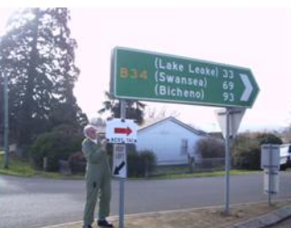
A: Rob Gard, part of the ground crew, here at Campbell Town putting up the arrows for driver directions. B: Marking the fence on the southern end of Quorn Hall strip. LB: Looking north Quorn Hall concrete runway stretches 1.5 km there is another chunk of runway to the south in front of Rob.

We had to wait for the weather, as you do in Tasmania, the postponement was worth waiting for as the still Winter conditions proved to be perfect with a big blue sky, light winds and strangely no