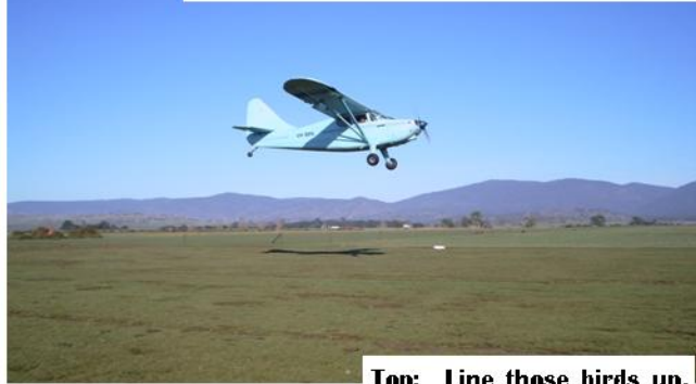
Top: Line those birds up, including the helicopters 22 aircraft were involved in the day. A: Perfect flying weather greeted Martin Reynoldson's Stinson Voyager 108 VH-BPS as it touched down at Tunbridge.