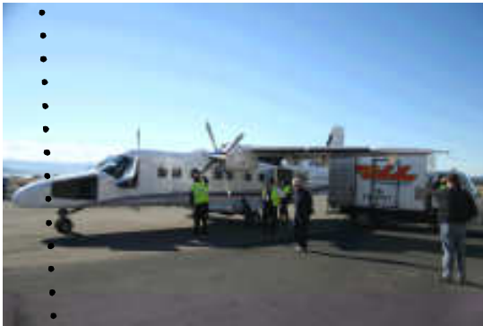
Dornier 228 landed at Cambridge Airport, operating a freight run Melbourne, Launceston, Cambridge, return. B: Allison turbine engine

Snapped at Cambridge, a Toll Aviation freighter a 228 turbine powered Dornier. One of the larger aircraft to drop into Cambridge - it was impressive, loud and used plenty of runway.